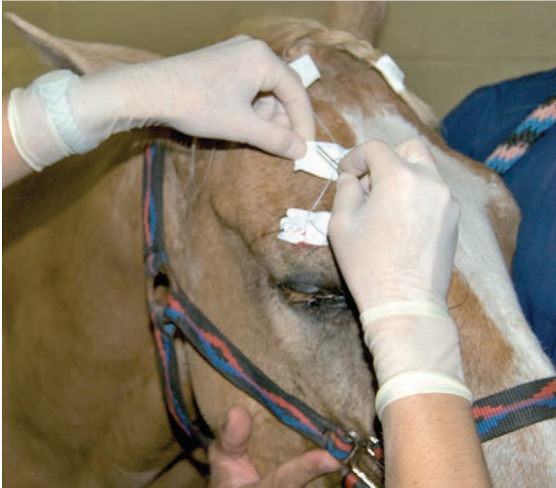
Figure 3: A subpalpebral lavage catheter placed in the upper eyelid for easier medication administration (Gilger, 2011).

Other medications are directed at making the eye more comfortable. Atropine is used topically to dilate the contracted pupil to help with ocular pain. Systemic anti-inflammatories (NSAIDs) are given to control inflammation and provide pain relief.